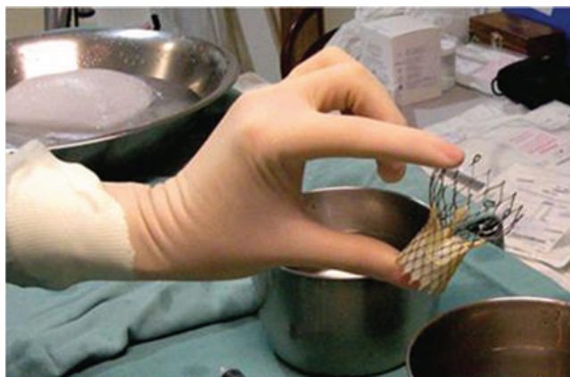
Figure 1 Bioprosthesis of three porcine pericardium leaflets mounted and sutured in a self-expanding nitinol stent.

series of vascular molds to reduce its profile and is fixed at an 18-French delivery system, releasing the prosthesis after balloon valvuloplasty (Figure 2).