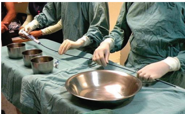
Figure 2 18-French prosthesis delivery system.

The puncture or dissection area was infiltrated with local anesthetic (bupivacaine 0.5% or ropivacaine 0.75%), as well as at the end of the procedure, to minimize postoperative pain. We kept the temporary pacemaker until discharge from the postoperative unit (POU).